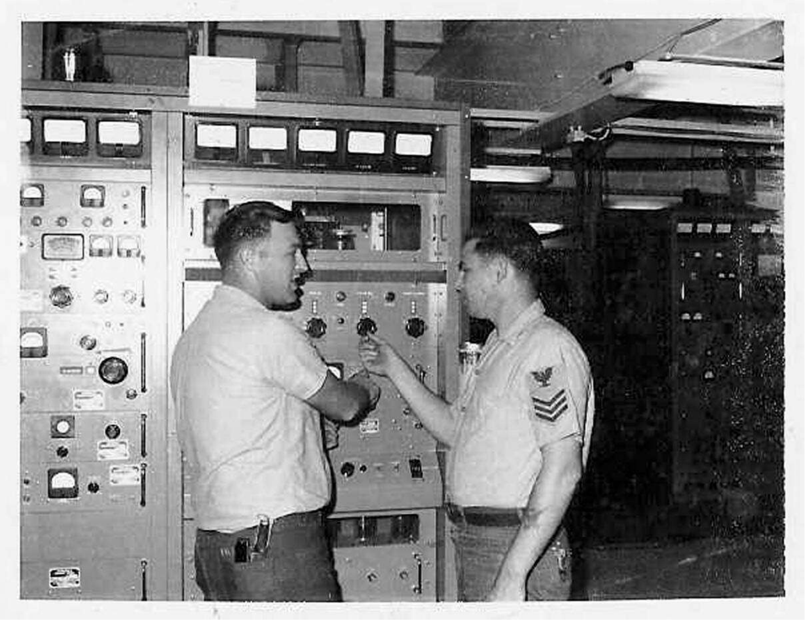
RM2 Huber on left and me discussing the FRT-39 Transmitter on the Transmitter Deck.