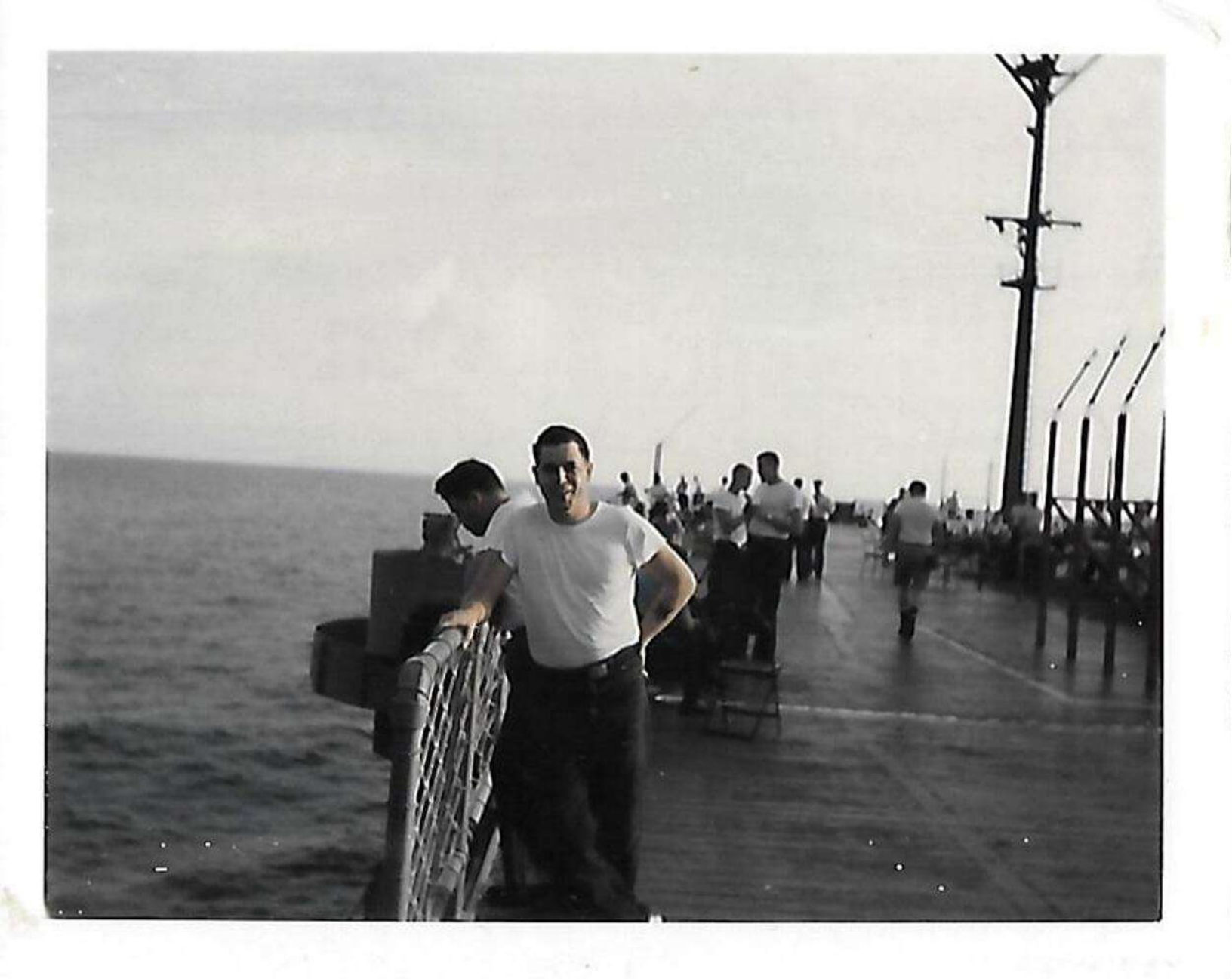
Me standing on deck during a cookout.