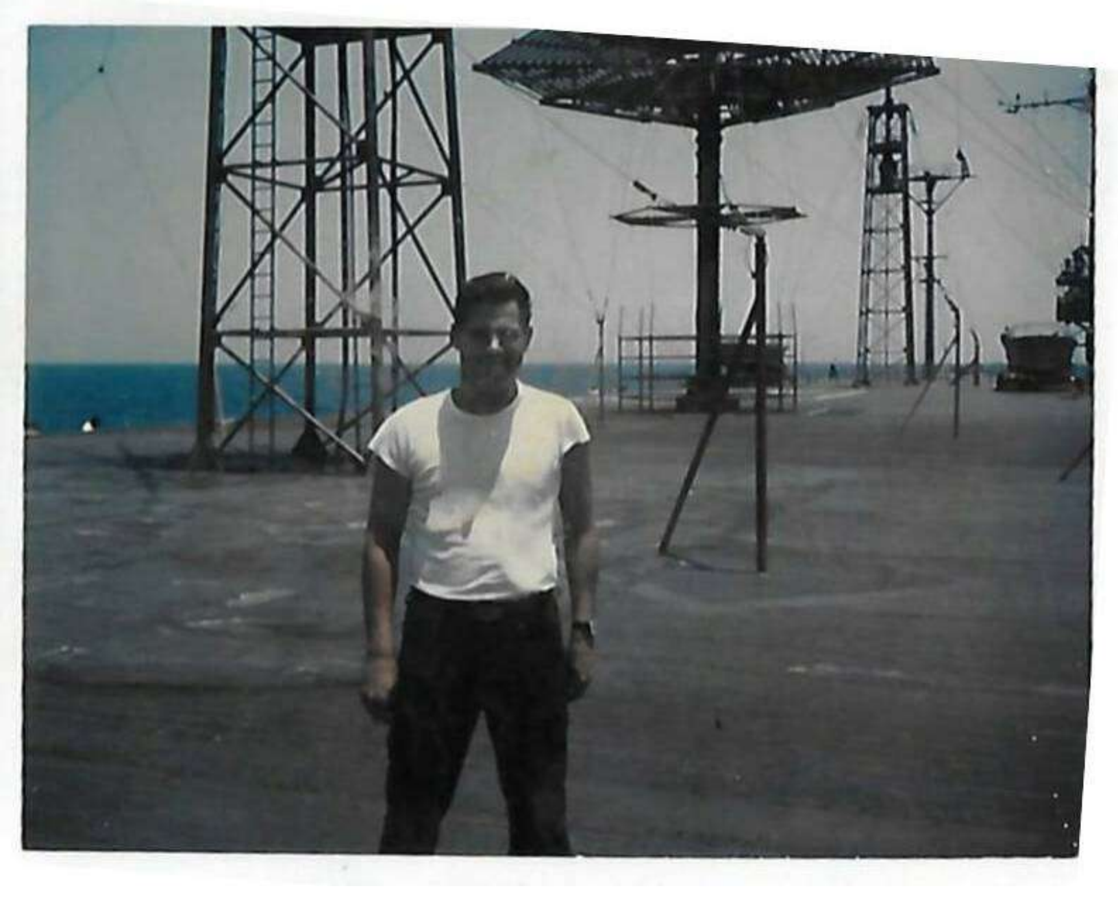
Me on the Antenna Deck.